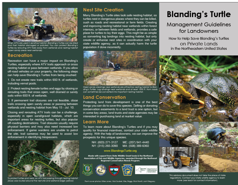
Figure 2. Cover and back panels of a brochure outlining Best Management Practices for Blanding's Turtles intended for use by interested landowners. One thousand copies were printed and distributed to states, and a PDF will be available at www.BlandingsTurtle.org